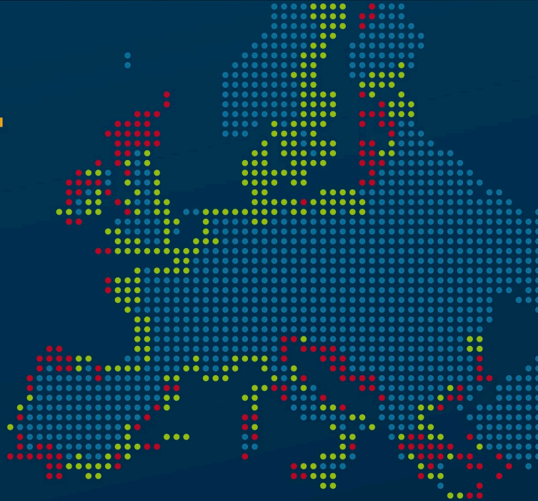
FISHING DEPENDENCY OF EUROPEAN COASTAL REGIONS 1

Fishing has been part of coastal communities for as long as they have existed and forms their economic and social fabric.